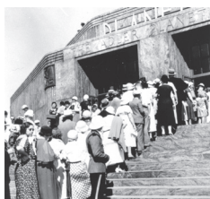
1933 World's Fair