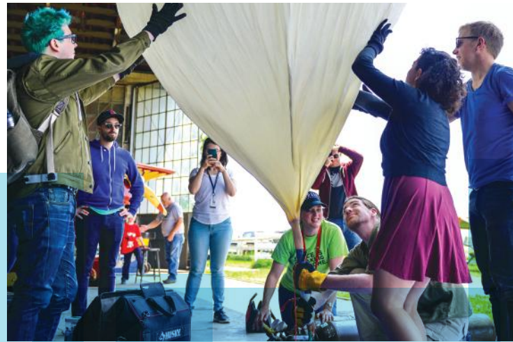
ABOVE RIGHT: Far Horizons participants prepping the high-altitude balloon on launch day.