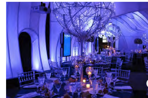
CLARK FAMILY WELCOME GALLERY