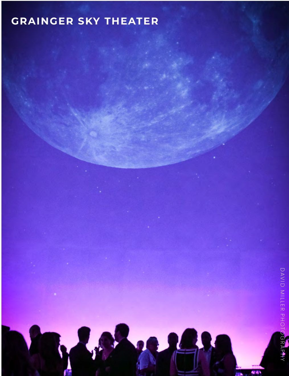
GRAINGER SKY THEATER